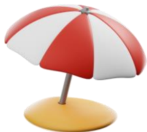
Nature, ocean and beach