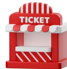
Shows and theme parks