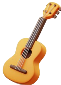
Music and movies