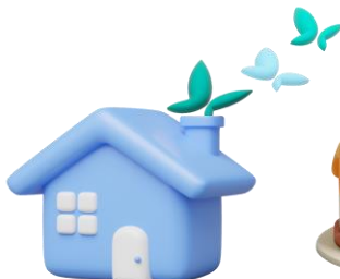
Family, home, and personal experience