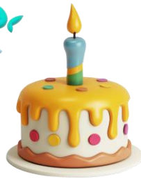
Parties and birthdays